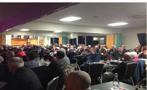
150 Seat Restaurant