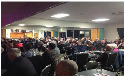
150 Seat Restaurant